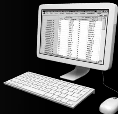
Figure 1. Cross-species data of equine samples generated with equine CG+ library file ( U133Plus_equine ), human GeneChip® library file ( U133Plus2.0 ) and Affymetrix GCOS software. High hybridisation signal of the CG+ library file is due to improved sensitivity of the human GeneChip® array for equine cross-species analysis.

The cross-species library files, developed with CG+ technology, enable robust data analysis due to the elimination of poor signals as a result of genetic variability. The new library files retain the specificity of GeneChip® technology, while increasing sensitivity (see figure 1 ).